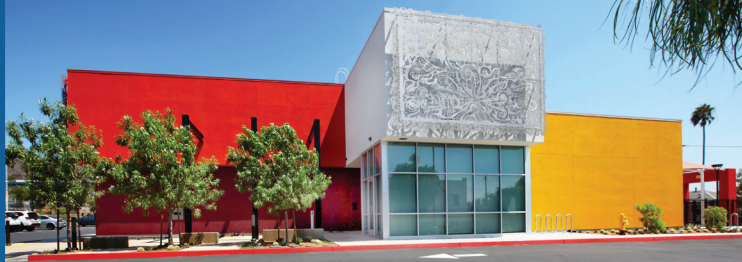
SAN DIEGO STATE UNIVERSITY SOUTH CAMPUS PLAZA